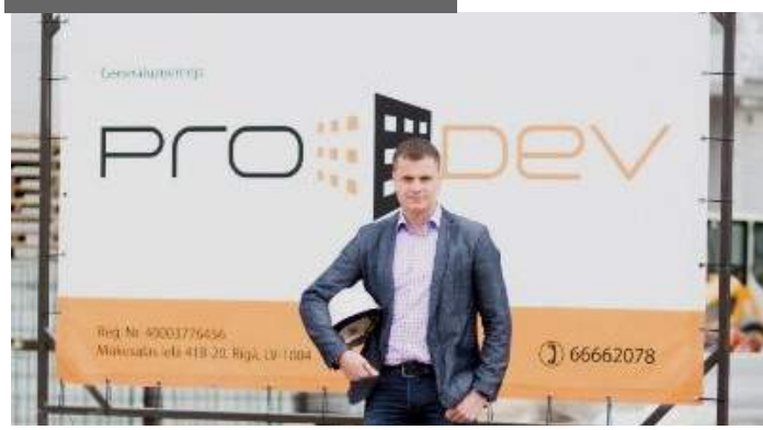
MINI INTERIEW WITH THE CHAIRMAN OF THE BOARD OF LLC PRO DEV