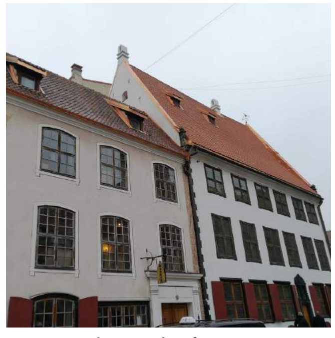
Total renewed roof area: 530 m2 Renewable facade area: 400m2